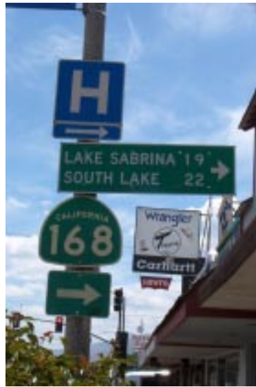
Go West on 168 (W Line St)