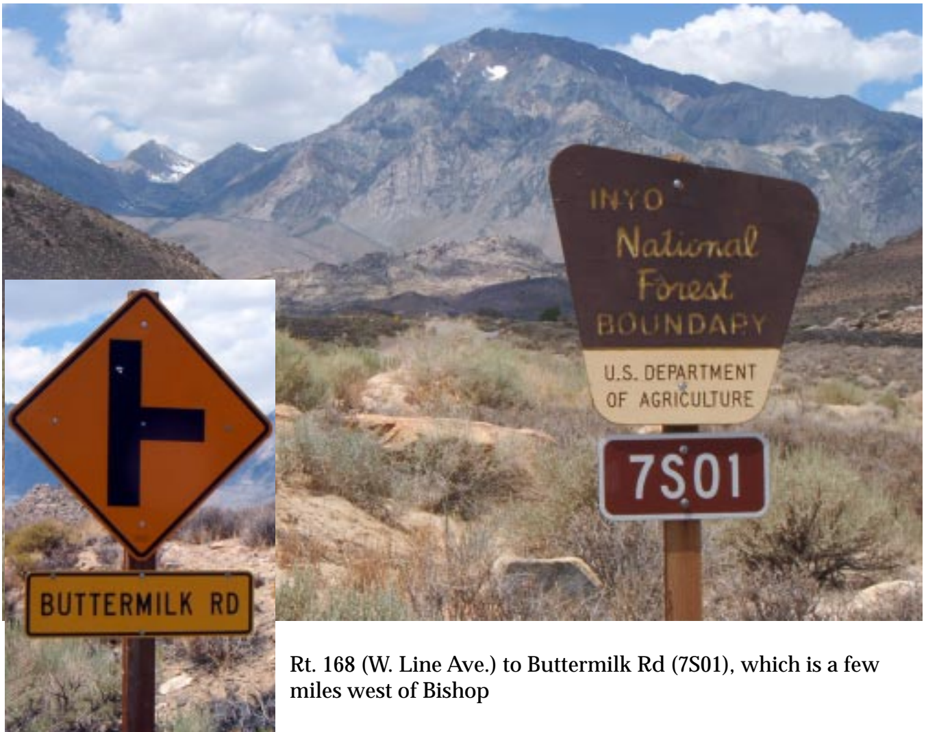
Rt. 168 (W. Line Ave.) to Buttermilk Rd (7S01), which is a few miles west of Bishop